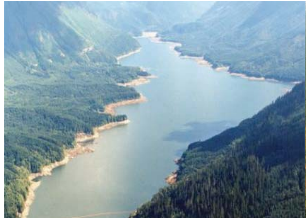
The Spada Reservoir in Shohomish County was formed in 1965. It holds 50 billion gallons of water, covers nearly 1,900 acres and has 17 miles of shoreline.

The Water Supply Forum website also features a section dedicated to the recently released 2009 Regional Water Supply Outlook . The 2009 Outlook is a comprehensive assessment of municipal water