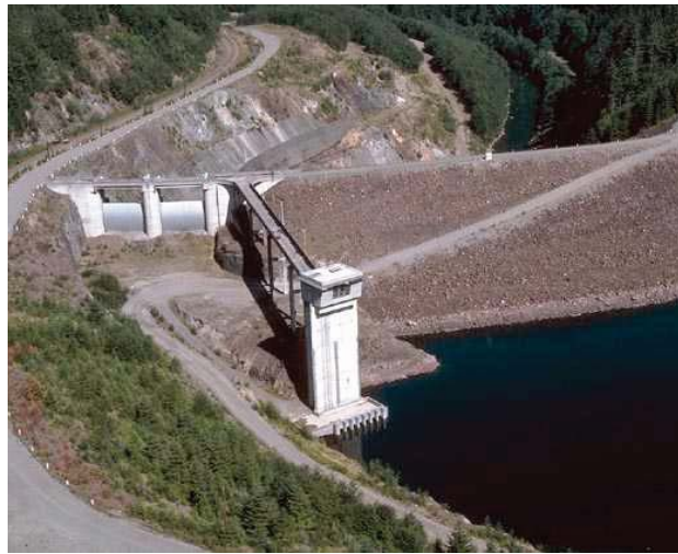
The Howard A. Hanson Dam originally named the Eagle Gorge Dam is located on the Green River, 21 miles east of Auburn, Washington.