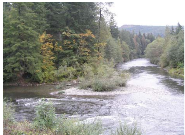
The Green River, a water source of Tacoma, Washington is 65 miles long and was once home to many small railroad and logging towns.

supply and demand in King, Pierce and Snohomish Counties. The Outlook contains current and projected municipal water demands for each county within the three-county region. It also includes an analysis of regional water supplies and details of potential future municipal water supply options including enhanced conservation and wastewater reuse. The Outlook can be downloaded by section or in its entirety on the Forum website. The 2001 Regional Water Supply Outlook resides in this web section as well.