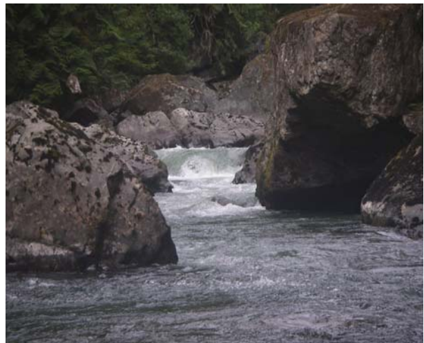
The 30-mile Sultan River in Snohomish County is dammed in its upper third by the Culmback Dam to form Spada Lake.

“It’s great to see organizations and municipalities continue to work together to educate and communicate with water customers to help them appreciate and get the most from our remarkable resource, she says proudly. “It’s a pleasure to work with such a great community of water professionals to consistently bring clean, safe water to Puget Sound water customers.”